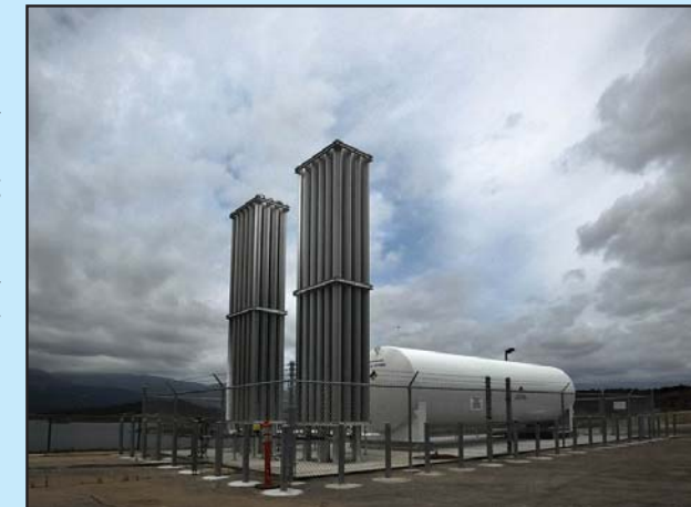
Casitas Municipal Water District installed a new hypolimnetic oxygenation system during September of 2015 to help minimize water quality problems in Lake Casitas.

The Casitas Municipal Water District is supplied by a blend of ground water and surface water that is treated before it is distributed to the public. The surface water comes from Lake Casitas, located near the junction of Highway 150 and Santa Ana Road, and the ground water is drawn from the Mira Monte Well. Most of the watershed is federally protected to limit contamination of the lake. For additional protection we inspect the watershed