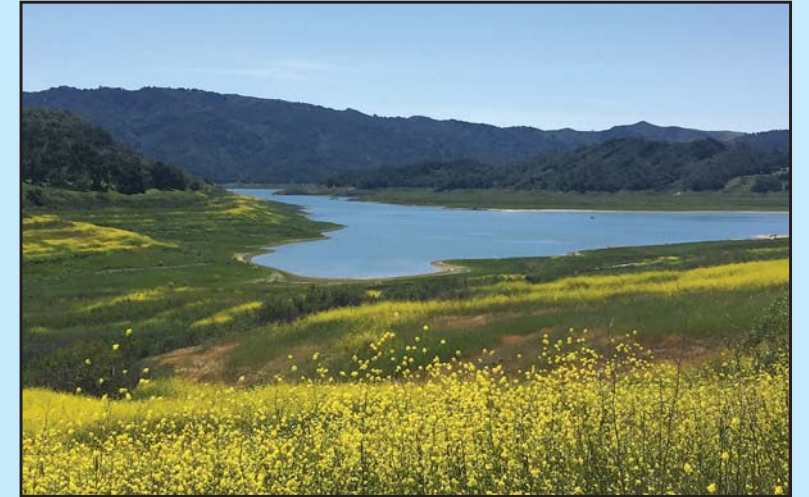
Lake Casitas – Drought still on as lake levels drop.

It is critical that all residents, agriculture, businesses, and institutions take extra measures to conserve water into the foreseeable future. Effective July 1, 2016, water allocation assignments for Casitas' direct customers will be reduced by 10%.